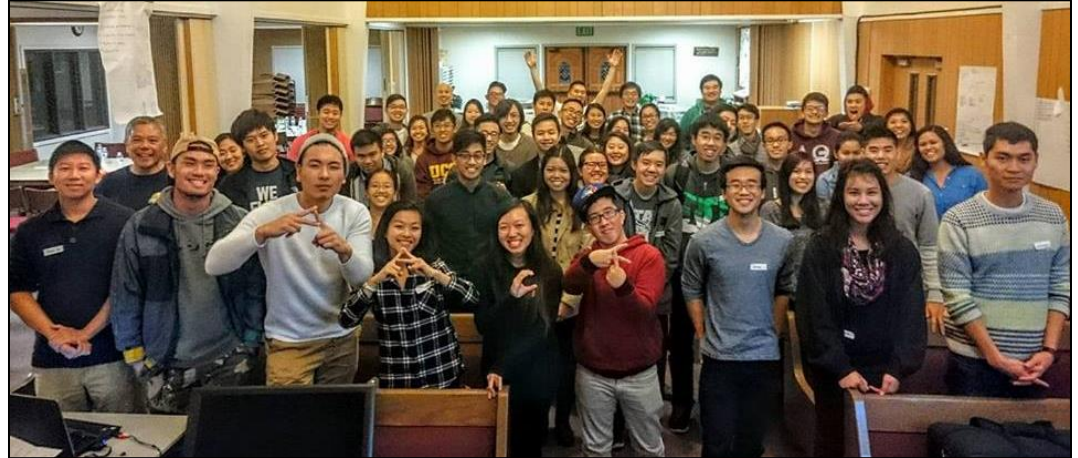
AACF NorCal Student Training

It was a blessing to engage the next generation of student leaders. My responsibilities and role on the AACF