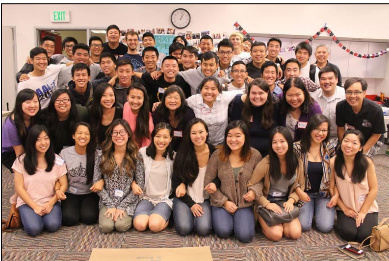
AACF SoCal Student Training

Please pray for these student leaders. They are the next generation that will bring the Gospel into their homes, their neighborhoods, their churches, their workplace, their community, and the world. Pray for me. That I will not forget to get out of the office and respond to the opportunity to do face-to-face ministry.